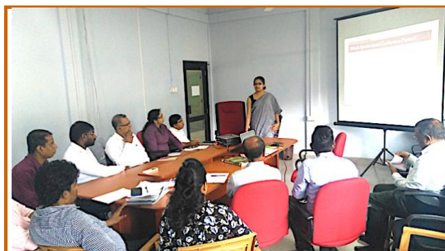
At RDA Research Division, Ratmalana