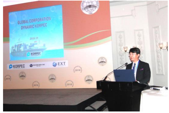
Presentation on "Sea Side Construction" by Denver Korea E & C Co. Ltd. Korea and Port Engineering Cooperation (KORPEC).