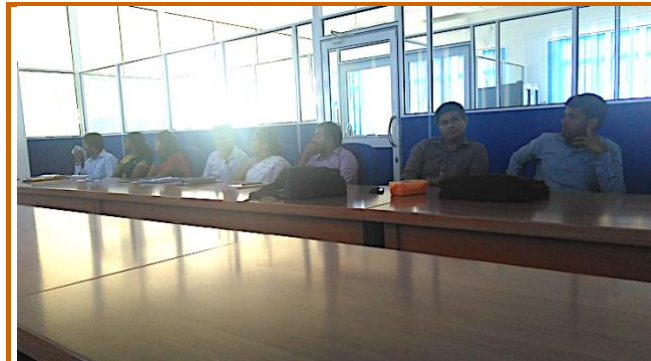
At Irrigation Department, Colombo 07