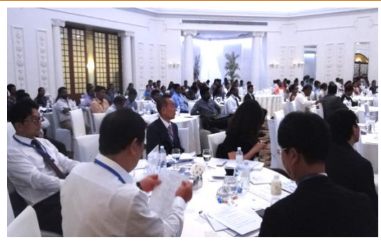
Segment of the participants