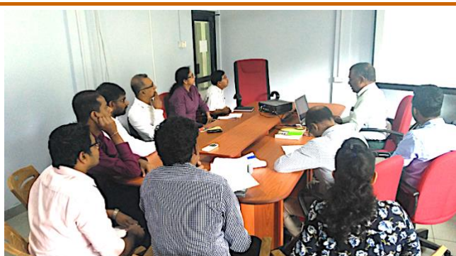
At RDA Research Division, Ratmalana

Some glimpses of the event are depicted below.