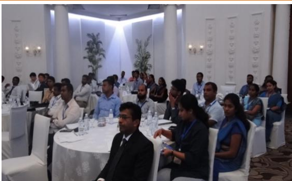
Segment of the participants