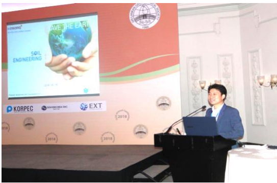
Presentation on "Point Foundation and Screw Anchor Piles" by EXT Co. Ltd. Korea