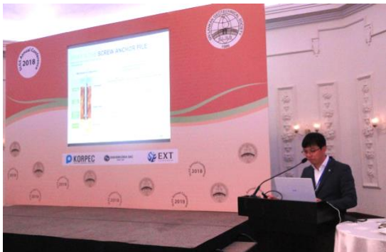
Presentation on "Basement Construction & Soil Improvements" by EXT Co. Ltd., Korea.