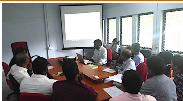
At RDA Research Division, Ratmalana