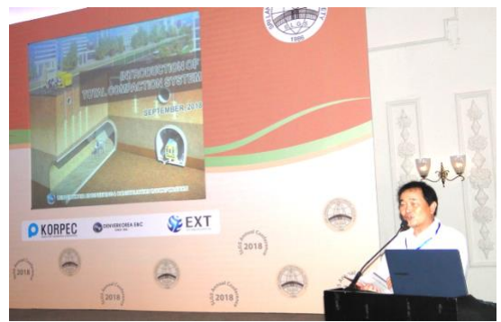
Presentation on "Compaction Grouting Techniques" by Denver Korea E & C Co. Ltd.