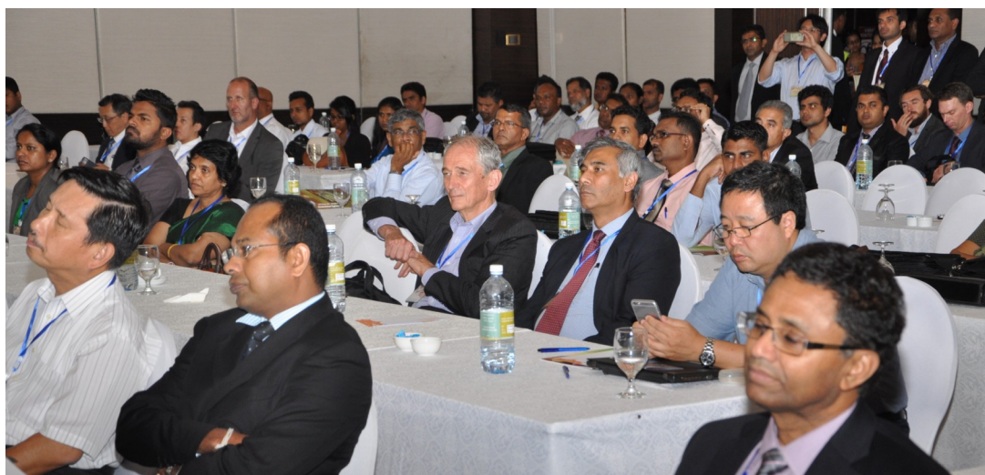
A section of the participants at the closing ceremony