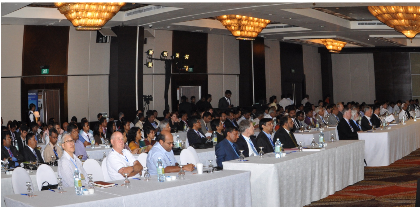
A section of the enthusiastic participants on the opening day