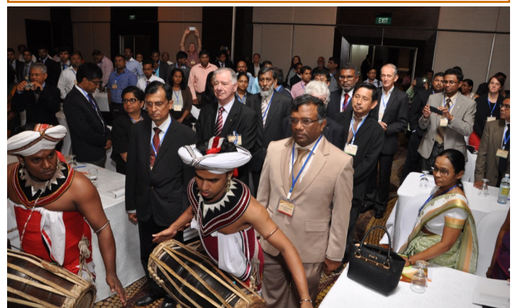
The grand inauguration of the ICGE 2015

Oral presentations were made in three tight parallel sessions.