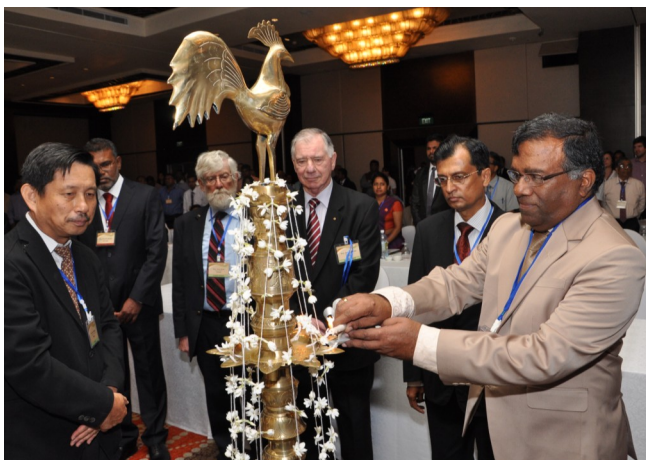
Lighting of the traditional oil lamp